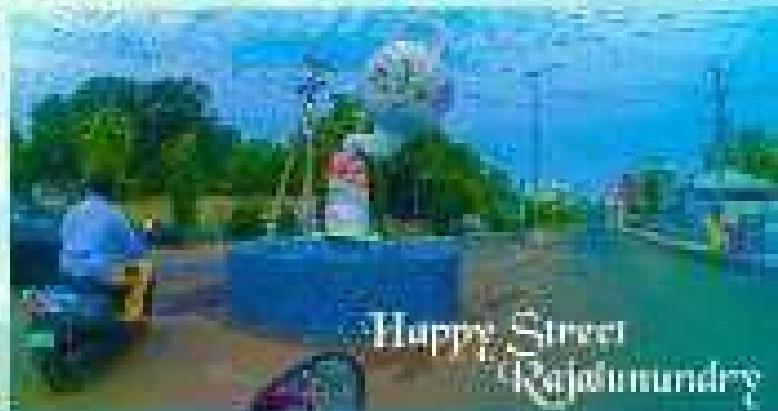
Happy Street Rajahmundry