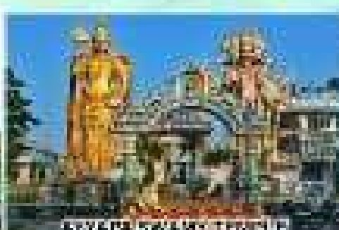
AYASA SWAMY TEMPLE