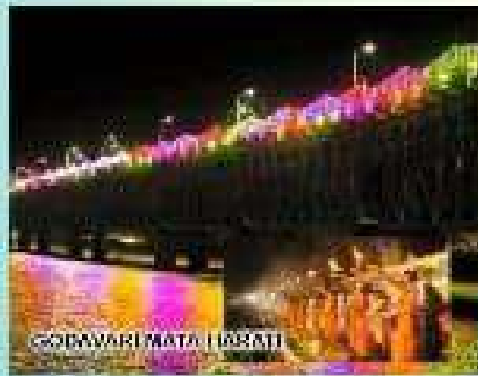
GODAVARI MATA HARATI