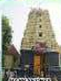
MAMANDIRA SWAMY TEMPLE