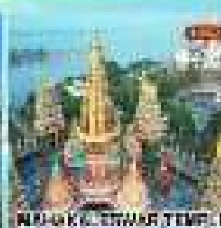
NAGA KALASWAR TEMPLE